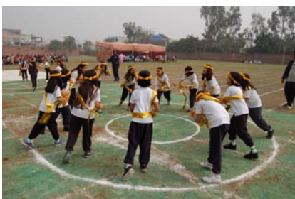
Sports Day 2008