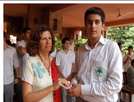
Prefects Ceremony 2008

Finally, students can participate in the Student-Life Organization without assuming an administrative role. For example tutors or trainees