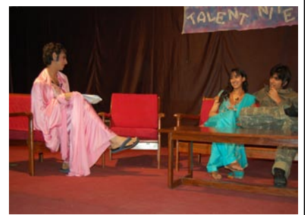
Talent Nite 2007