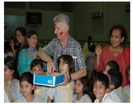
Juniors Fun Fair