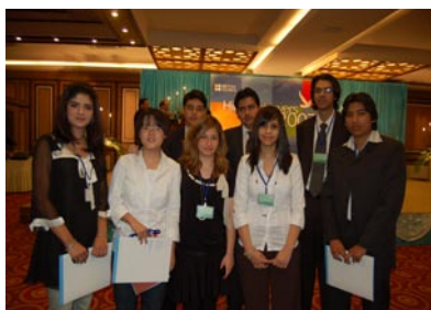
Top Achievers 2008