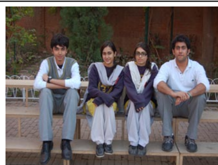
Student Life Organisation Heads