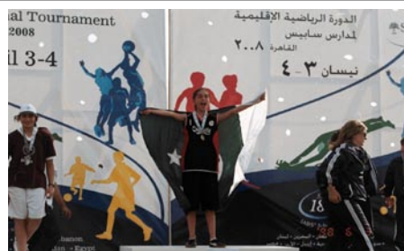
Regional Tournament in Egypt, 2008