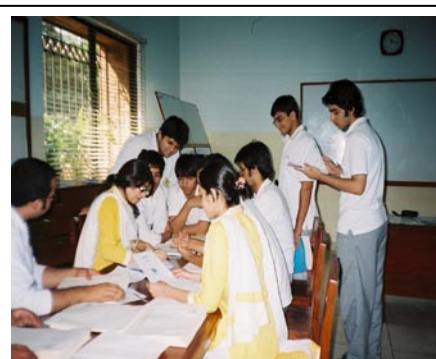
Student Life Organisation Meeting