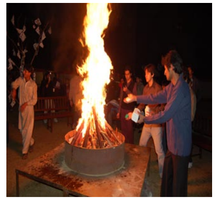
Winter Bash 2007