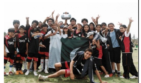
Regional Tournament in Egypt, 2008