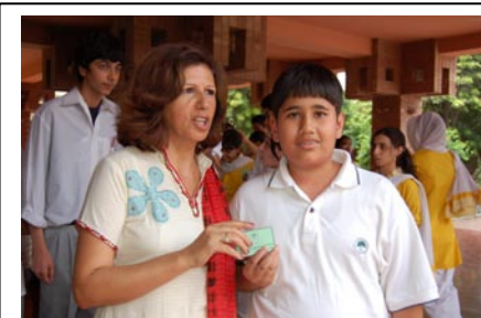
Prefects Ceremony 2008